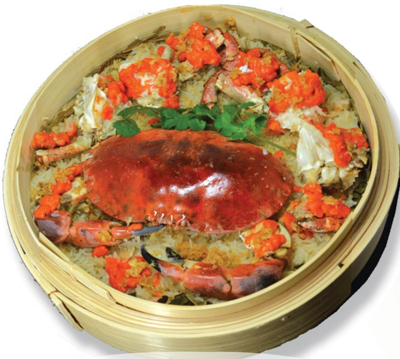
原籠糯米蒸蟹 £20.80 Steamed crab with garlic and glutinous rice in bamboo steamer