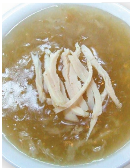
紅燒雞絲翅 (每位) £16.50 (per head) Shredded chicken shark's fin soup