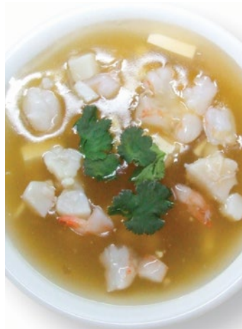
翡翠海皇羹 (每位) £6.80 (per head) Jade diced seafood soup