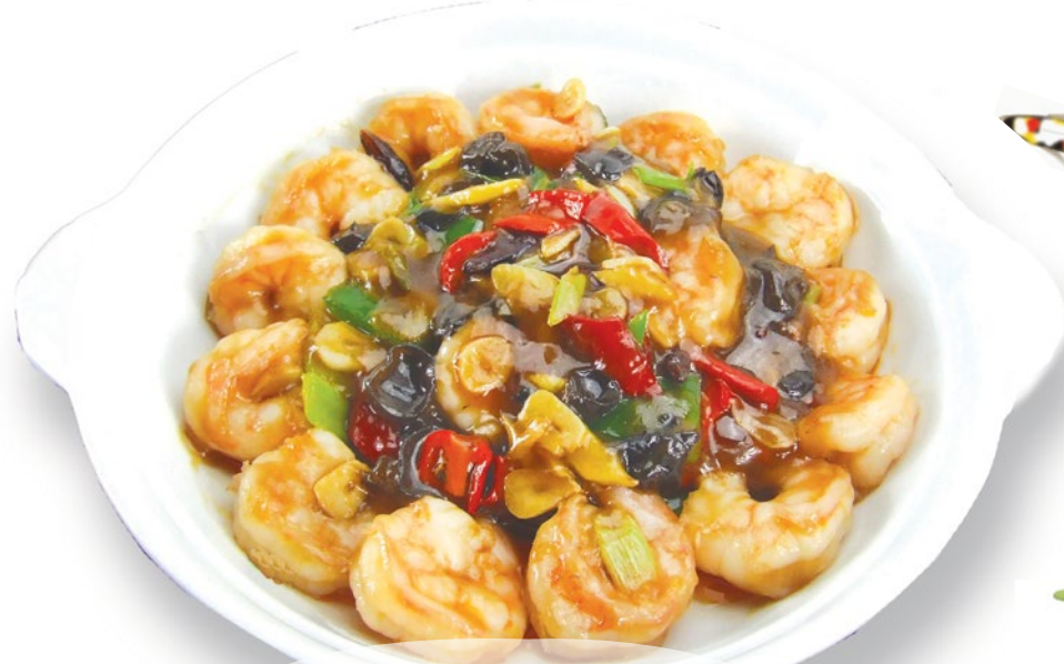
香辣蝦球 £18.00 Stir fried king prawns with chillies