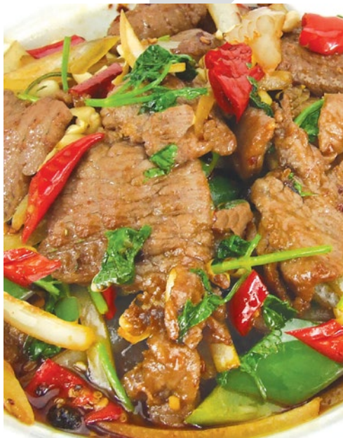
老乾媽炒羊肉 £17.50 Stir fried sliced mutton in Laoganma chilli sauce