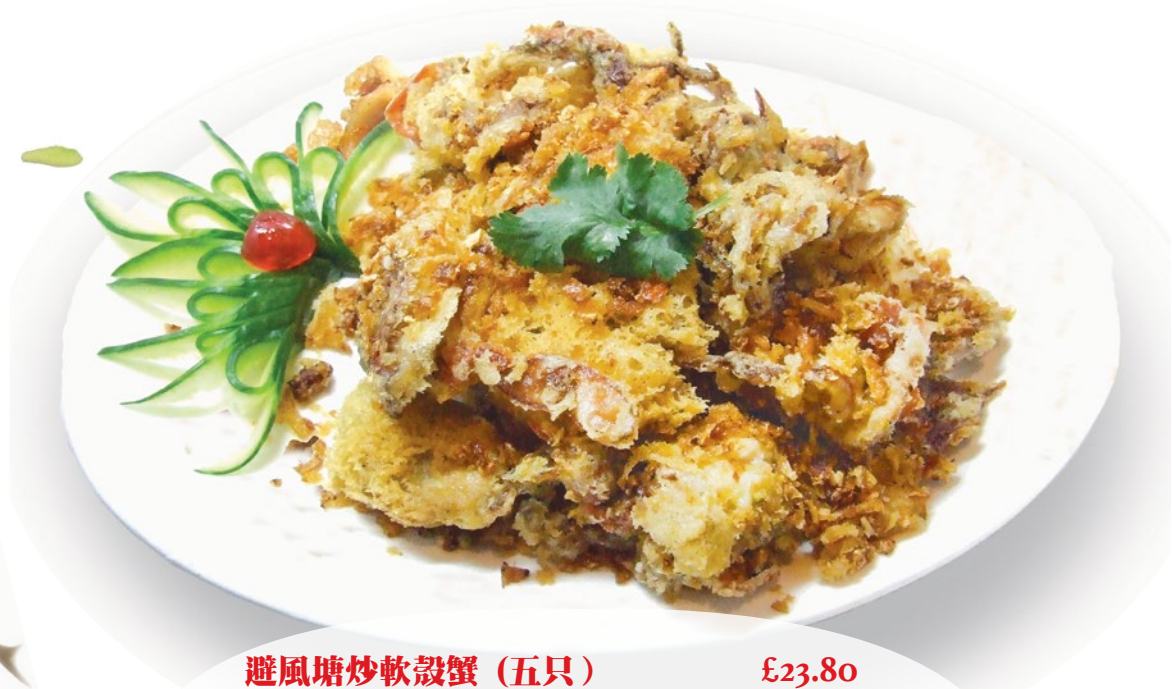
避風塘炒軟殼蟹 (五只) £23.80 Harbour shelter style fried spicy soft shell crab