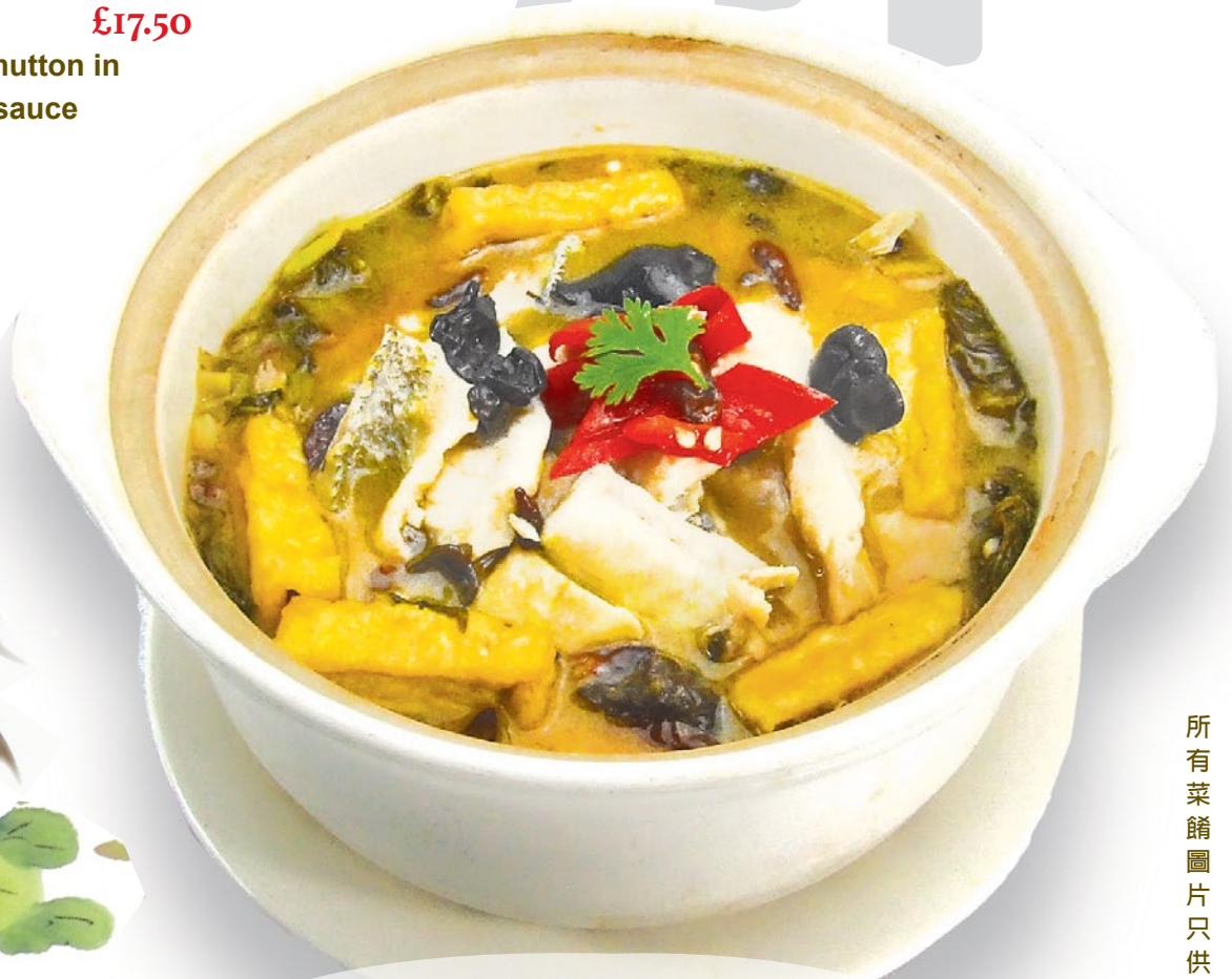
沙煲酸菜鱸魚 £29.50 Sea bass with preserved pickled vegetables casserole