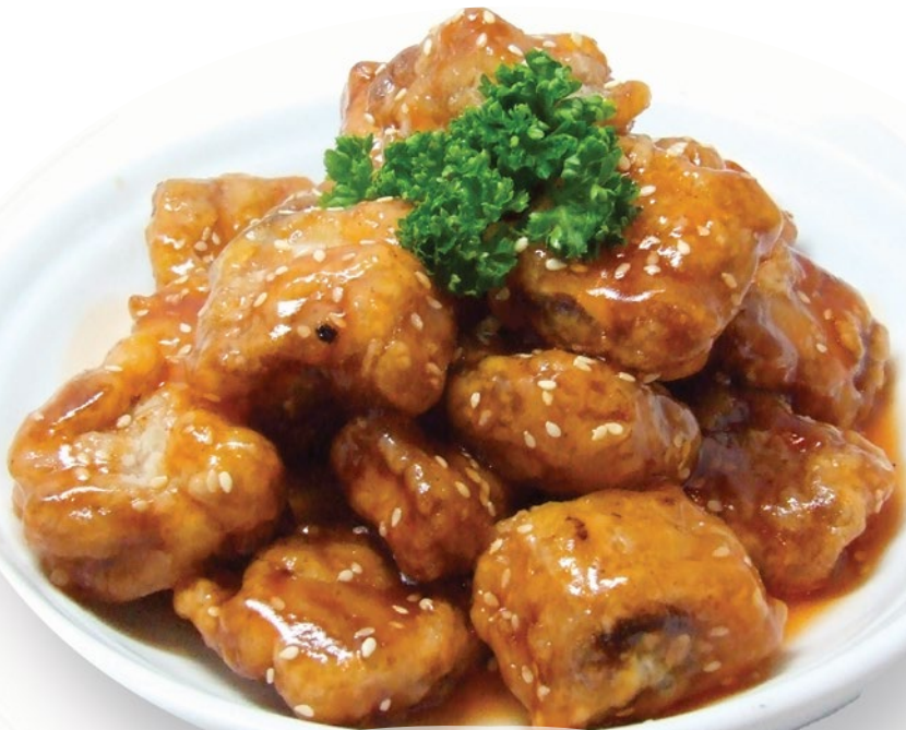
糖醋麻仁排骨 £15.50 Sweet vinegar spare ribs with sesame seeds

麻辣水煮去骨鱸魚 (每條) Spicy hot poached de-boned whole sea bass .....£27.50