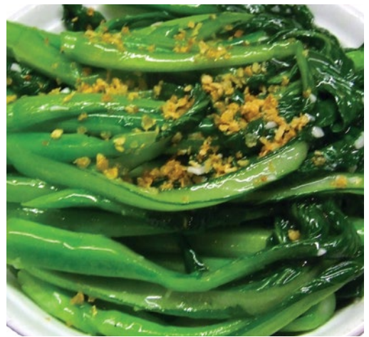
蒜蓉炒中國菜心 £18.00 Stir fried choi sum with crushed garlic