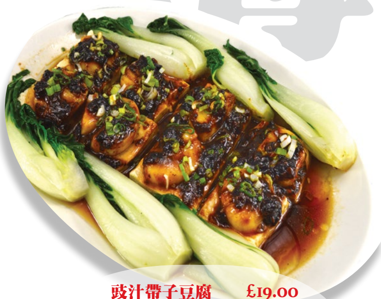
豉汁帶子豆腐 £19.00 Steamed beancurd and scallops with blackbean sauce