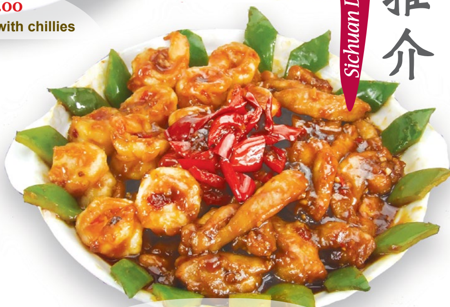
龍鳳相會 £18.50 Stir fried spiced king prawns and sliced chicken