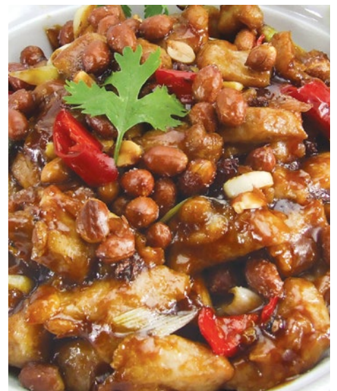
宮保雞丁 £15.80 Gongbao diced chicken with peanuts and dried chillies