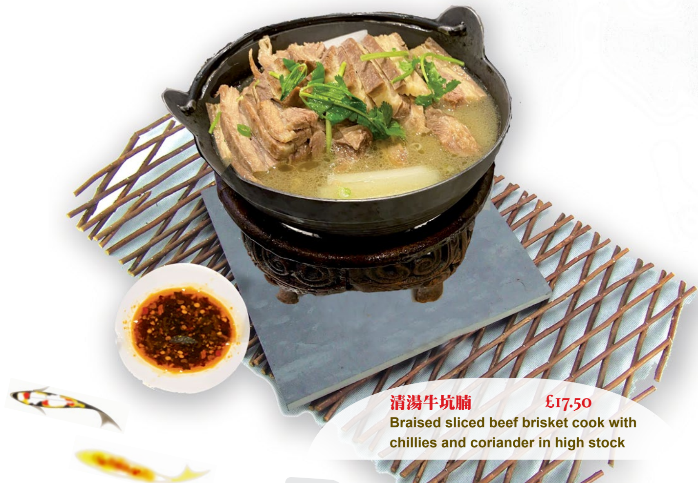
清湯牛坑腩 £17.50 Braised sliced beef brisket cook with chillies and coriander in high stock