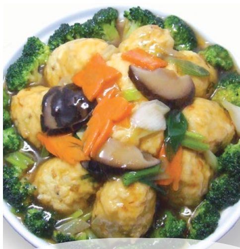
三鮮琵琶豆腐 £17.00 Deep fried beancurd stuffed with diced seafood cooked with broccoli in clear sauce