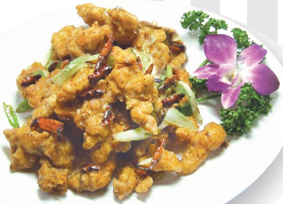
四川辣子雞 £15.50 Sichuan style spicy hot diced spring chicken