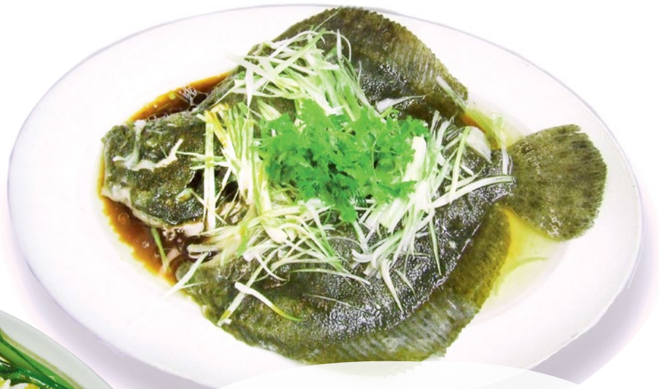
薑蔥蒸多寶魚 Seasonal price 時價 Steamed turbot with spring onion and ginger in light soya dressing