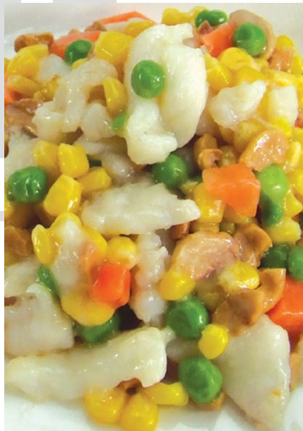
金粒魚米 £20.80 Stir fried diced fish and sweet corn