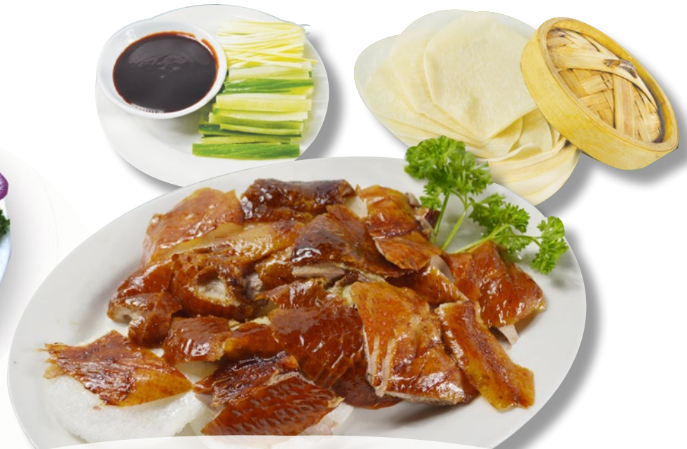
片皮鴨 每只 Whole £36.00 半只 Half £23.00 Sliced glazed roast duck served with spring onion, hoi-sin sauce & pancakes