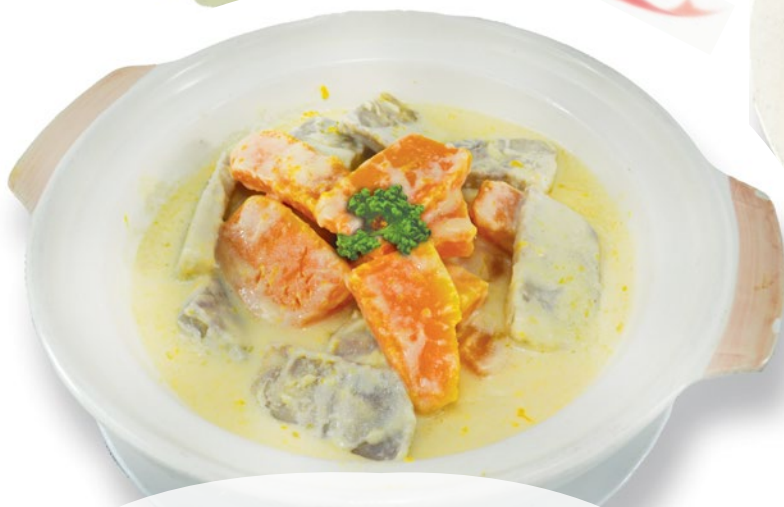
奶香南瓜香芋煲 £15.00 Braised sliced pumpkin, taro cook with milk and butter clay pot