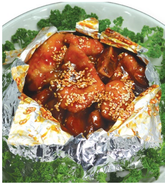
錫燒豬扒 £16.00 Pork chops with sesame seeds foil grilled