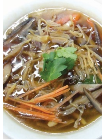
瑤柱鴨絲羹 (每位) £6.00 (per head) Sundried scallops and shredded duck soup