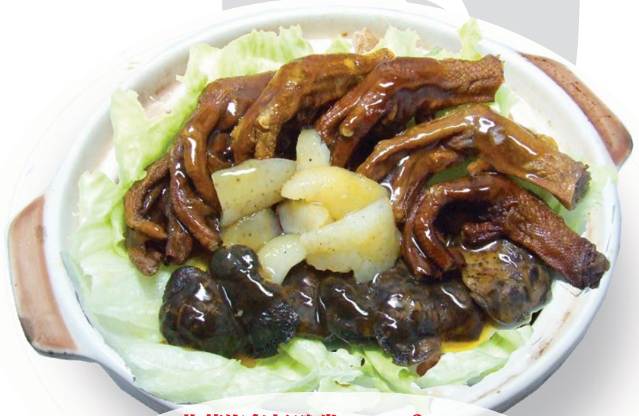
北菇海參扒鴨掌 £42.00 Braised sliced sea cucumber with duck feet and mushrooms