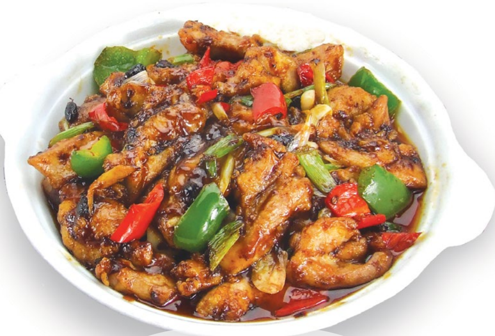
大千子雞 £15.50 Painter Daqian style stir fried sliced chicken with chillies