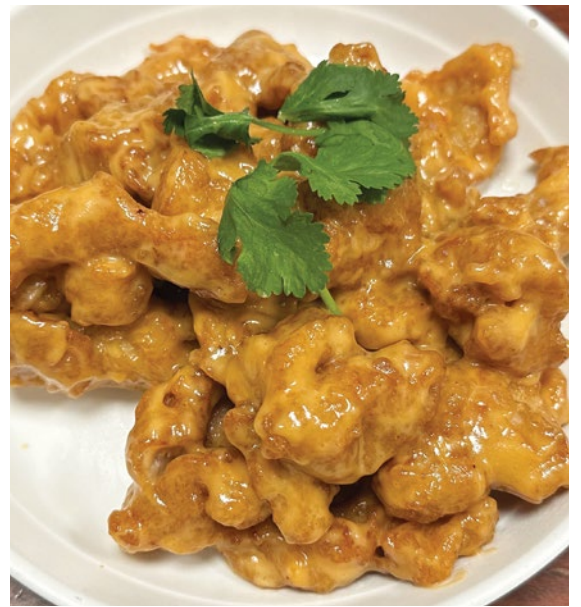
沙拉豬扒 £16.00 Pork chops with salad cream