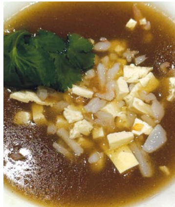
正宗海鮮酸辣湯 (每位) £6.50 (per head) Hot & sour seafood soup