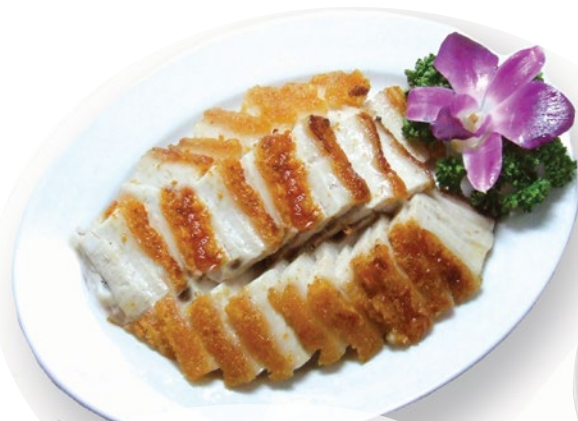
脆皮燒肉 £14.50 Roasted belly pork