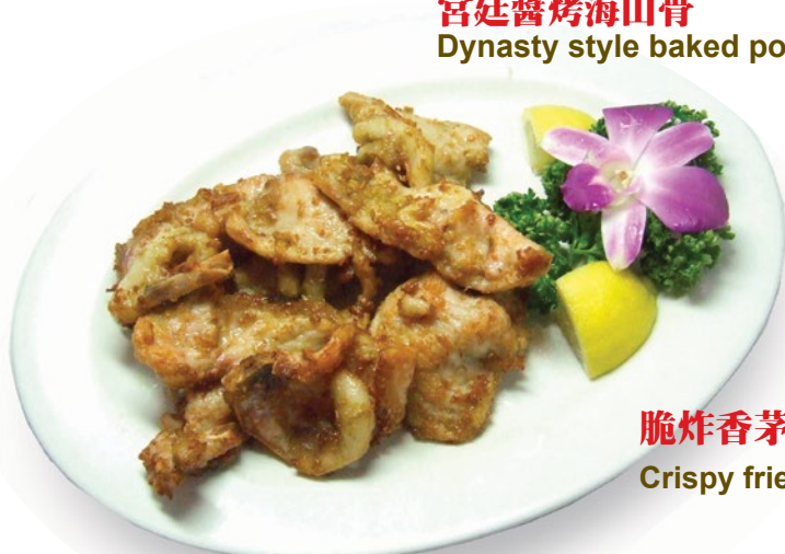
脆炸香茅豬扒 £16.00 Crispy fried pork chops marinated with lemon grass