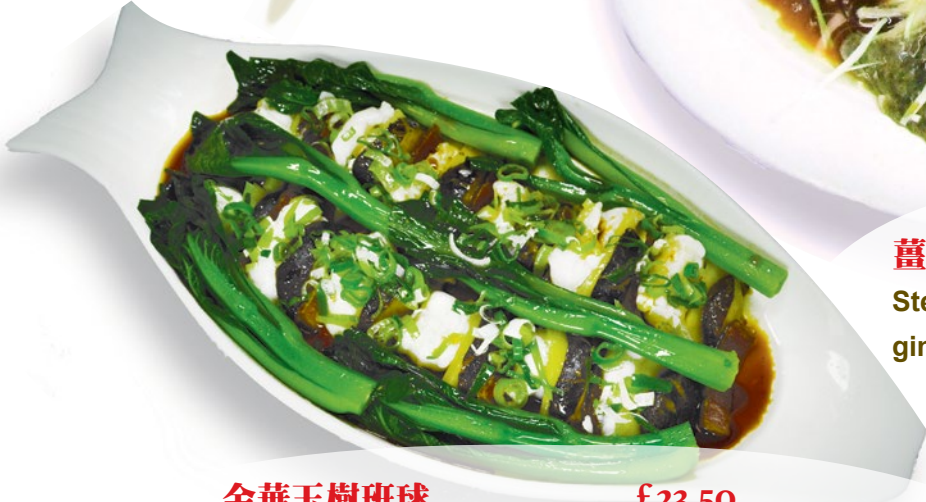
金華玉樹班球 £23.50 Steamed grouper fish pieces with sliced Chinese ham, Chinese mushroom and vegetables