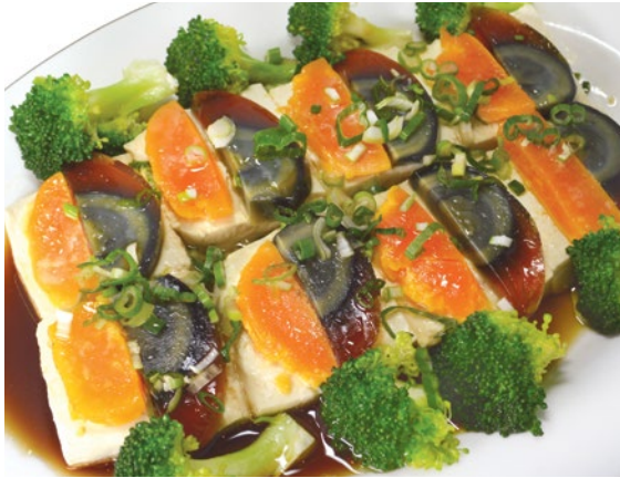
千歲豆腐 £15.00 Steamed tofu with sliced preserved duck eggs and sliced salted duck eggs