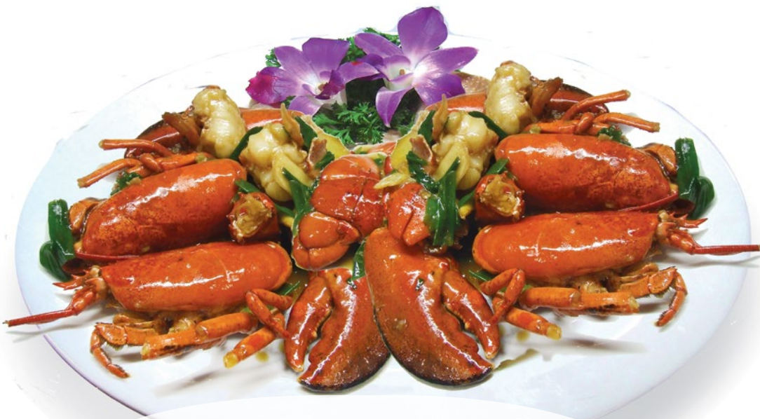
薑蔥焗龍蝦 Seasonal price 時價 Baked lobster with spring onion & ginger