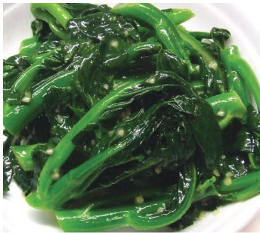
蒜蓉炒中國芥蘭 £18.00 Stir fried kai-lan with crushed garlic