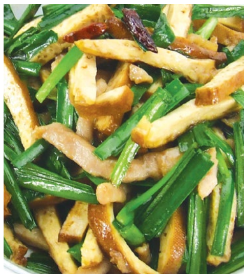
青韭肉絲豆乾 £15.50 Stir fried shredded pork with sliced dried tofu and chives