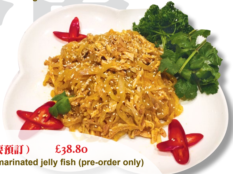
海蜇手撕雞 (一只雞) (需要預訂) £38.80 Whole shredded chicken with marinated jelly fish (pre-order only)