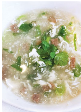
西湖牛肉羹 (每位) £6.00 (per head) West Lake beef thick soup