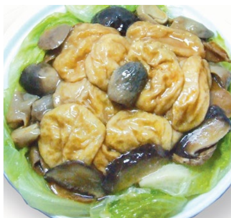
三菇扒生筋 (素) £15.80 Braised strong flour dough with three types of mushrooms (V)