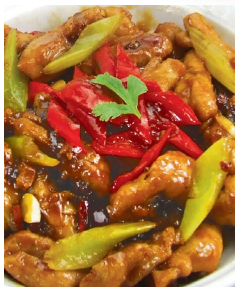
貴州香辣雞 £15.50 Guizhou style dry fried sliced chicken with chillies