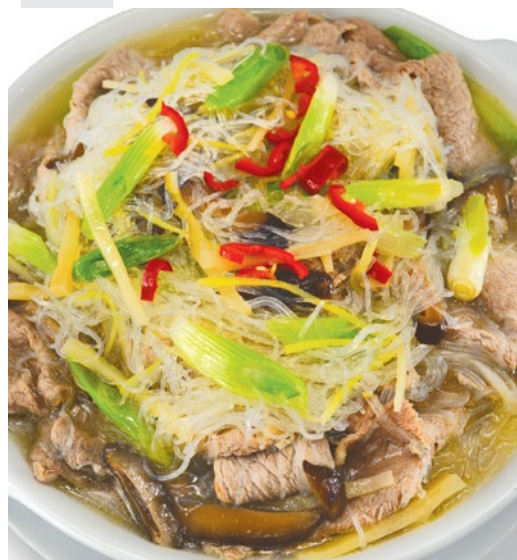
油鹽水粉絲肥牛 £17.50 Poached marble beef with vermicelli