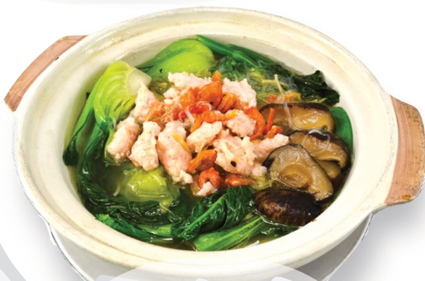
魚村粉絲雜菜煲 £19.50 Village style cooked with Chinese mushroom, minced king prawns, sundried shrimps and vegetables with vermicelli clay pot