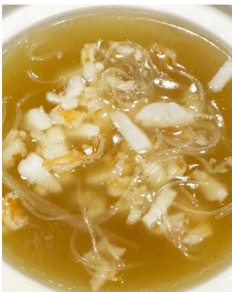
紅燒海鮮翅 (每位) £17.50 (per head) Diced seafood shark's fin soup