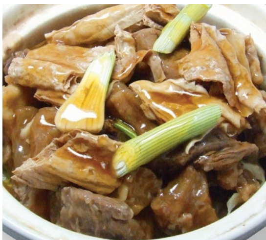
枝竹柱侯牛腩煲 £17.50 Beef brisket and dried beancurd with chu-how sauce clay pot