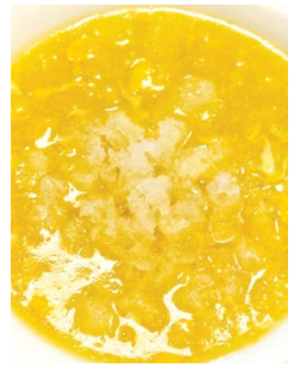
粟米魚肚羹 (每位) £6.80 (per head) Fish maw and sweet corn soup