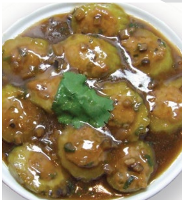
家鄉釀涼瓜(釀豬肉蝦餡) £18.50 Village style bitter melon stuffed with minced prawns and pork