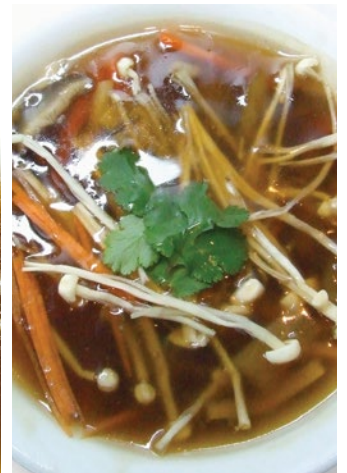
金菇四寶羹 (每位) £6.00 (per head) Four treasures mushroom, shredded duck and winter melon soup