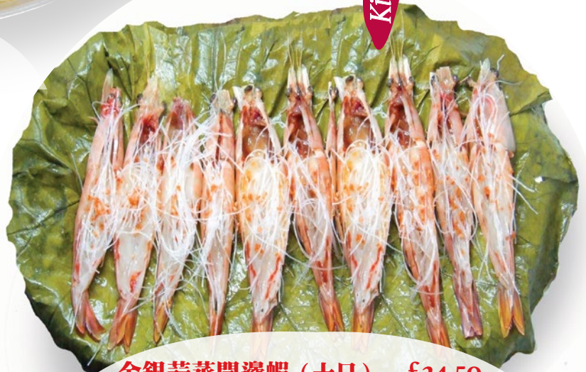
金銀蒜蒸開邊蝦 (十只) £24.50 Open sliced steamed king prawns with fresh crushed garlic