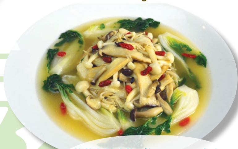
什菌上湯時蔬 (素) £16.50 Soaked assorted mushrooms with seasonal vegetables in high stock (V)