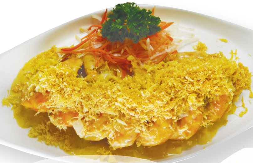
金絲奶油大蝦 (十只) £25.50 Deep fried shell-on king prawns coated in fried egg batter