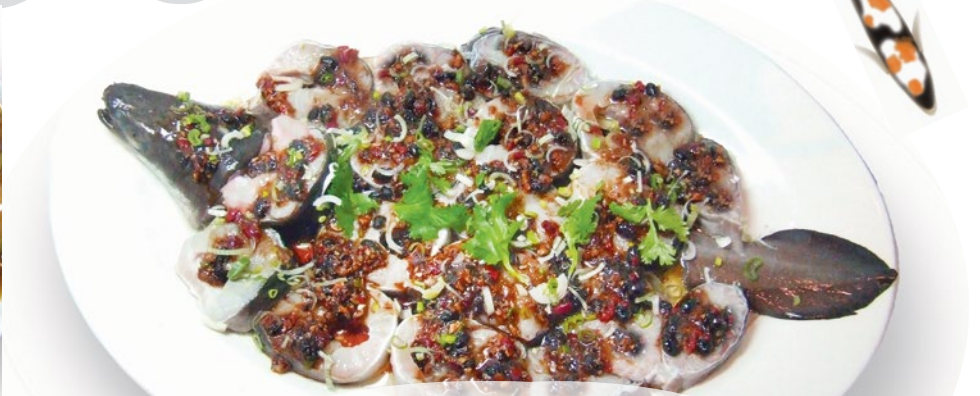
豉汁蒸鱈 Seasonal price 時價 Steamed chopped eel with blackbean sauce