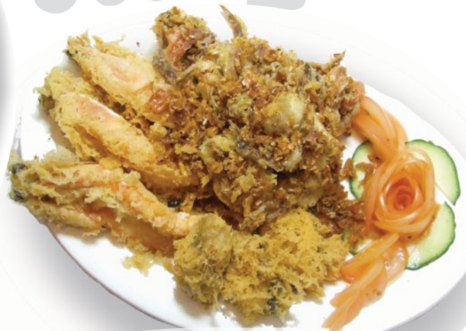
避風塘三寶 (軟殼蟹、大蝦及生蠔) £23.80 Harbour shelter style deep fried three treasures (Soft shell crab, king prawns and oysters)