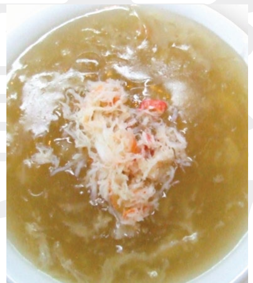
紅燒蟹肉翅 (每位) £17.50 (per head) White crab meat shark's fin soup