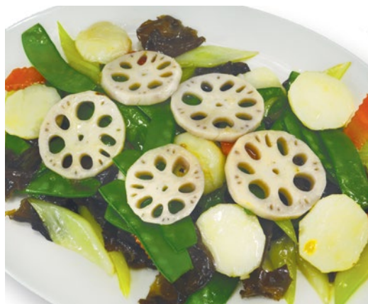
洋水芹香 (素) £14.00 Stir fried sliced lotus root with water chestnuts, mangetout, celery, carrot and black fungus (V)