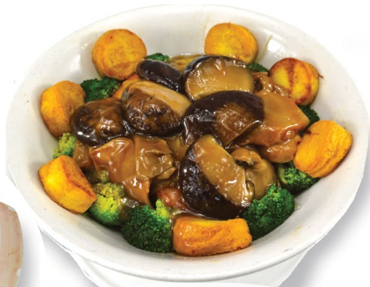
少林玉子素菜 (蛋豆腐) £17.50 Sliced egg beancurd and Chinese mushroom with vegetables